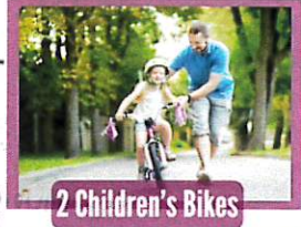
2 Children's Bikes