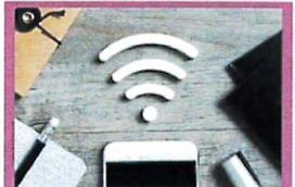
3 Months Free Long Lines Internet