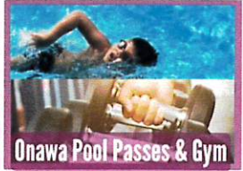
Onawa Pool Passes & Gym